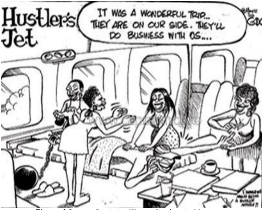
Figure -2 Cartoon Depicting Women Leaders As Masseuses

points to the sexualizing of women in leadership. Again, the women in demonstrated that they were unhappy with the content as was reported. "I want to demand an apology to all the lady members of parliament because we are here in our own right. We did not come here to massage anybody… we are here as members of parliament; and we want gender sensitive media, not people who look at us from the waist down and not the waist up." Capital News(May 22, 2013) from this statement, it can be deduced that women leaders point a finger at the gender insensitive and gendered media portrayal.